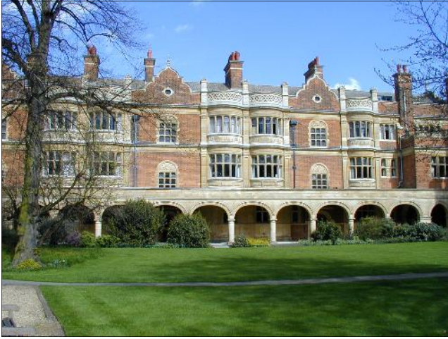
SIDNEY SUSSEX COLLEGE • CAMBRIDGE

Cumberland's Cambridge program provides an excellent overview of the UK and European Union legal systems in the first week. Then for the remainder of the program students choose two courses, each of which will enhance their understanding of both a substantive area of law and the comparative-law process. The program also includes a field trip to London, where visits are made to the Royal Courts of Justice, Middle Temple Inn of Court, and Parliament.