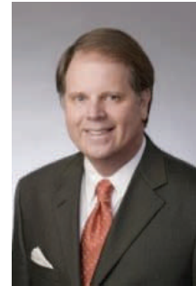
DOUG JONES '79

On September 8, 2010 at noon in the Moot Court Room, Doug Jones '79 will be the first of the Called to the Bar speakers for the 2010-11 academic year. He is a former United States Attorney for the Northern District of Alabama and is currently with the Haskell Slaughter Young & Rediker, LLC firm in Birmingham where he represents individual, institutional and corporate clients in complex civil and criminal litigation.