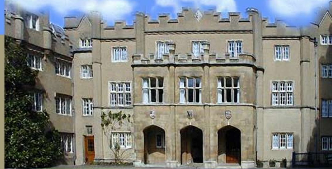
Sidney Sussex College, our Residential College in Cambridge, England